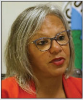
Robin Kelly (D) Robinkellyforcongress.org